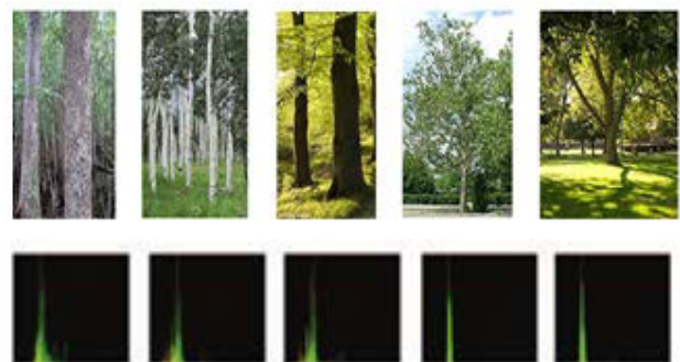
Fig. 2 (a). Some false positives and the statistical result of different H values of the trees

Markus Enzweiler et al. [13] have pointed out all the pedestrian detection systems make rather similar mistakes that typical false detections between pedestrian and the things which are dominated by strong vertical structure occur in local regions. For example, there are always false positive between the pedestrian and the trees. Fig.2 (a) shows some false positives and the statistical result of different H values of the trees and Fig.2 (b) shows some true positives and the statistical result of different H values of the pedestrians. Several pedestrian detection algorithms contain one step to refining the results of pedestrian detection [14] [15] [16]. Most refinement methods use the multi-frame information to reduce the false positive, which means the target must be tracked before refining. However, these methods, which are at cost of time, can't meet the real time request of the system. So, a new method was proposed using the color information to refine the detecting results in order to reduce the false positives between the trees and the pedestrians.