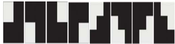
Fig. 1. The new features stand for the difference between the legs or arms of a walking pedestrian and the background.

Adaboost was used to select a set of features to build the best classifier as in [12]. The layer of the Adaboost is 15 as Markus Enzweiler has pointed out that the performance of the system runs in saturation when the number of layers of Adaboost is more than 15 [13]. For each layer the detection rate is 99.5% and the false positive is 50%.