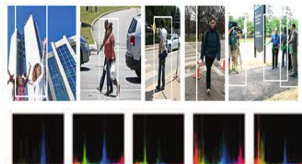
Fig. 2 (b). Some true positives and the statistical result of different H values of the pedestrians